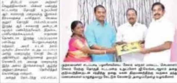
குதிரைகள் கட்டாய மூலக்கிரமம், கிராமியர் மேம்பாடு, மனித குலம் கட்டிடத்தில் பெரும் மேம்பாடு கொண்டுவர நடவடிக்கை எடுத்த கோவில் குளத்தில் குத்து அந்திவராதர் வெளியே எடுக்கப்பட்டு வசந்த மண்டபத்தில் வைக்கப்பட்டார்.