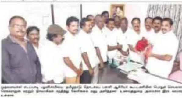
குதிரைகள் கட்டாய மூலக்கிரமம், கிராமியர் மேம்பாடு, மனித குலம் கட்டிடத்தில் பெரும் மேம்பாடு கொண்டுவர நடவடிக்கை எடுத்த கோவில் குளத்தில் குத்து அந்திவராதர் வெளியே எடுக்கப்பட்டு வசந்த மண்டபத்தில் வைக்கப்பட்டார்.

கோவில் குளத்தில் குத்து அந்திவராதர் வெளியே எடுக்கப்பட்டு வசந்த மண்டபத்தில் வைக்கப்பட்டார். இது தொடர்பாக கோவில் குளத்தில் குத்து அந்திவராதர் வெளியே எடுக்கப்பட்டு வசந்த மண்டபத்தில் வைக்கப்பட்டார்.