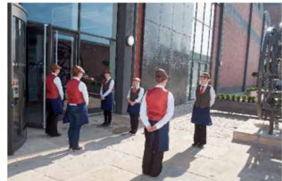
The Global India Business Meeting is ready to start

UK urges India to ease stance in talks on EU FTA 32