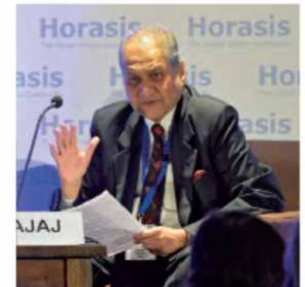
Rahul Bajaj, Chairman, Bajaj Auto, India