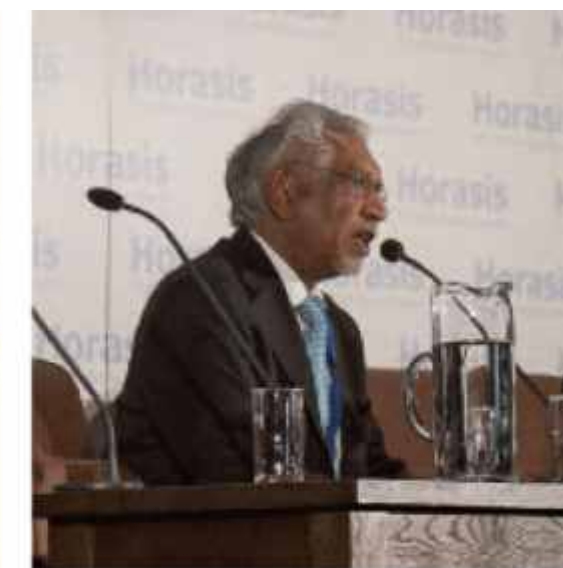
Mac Maharaj — 'a new vision of growth shall be focused on achieving inclusive prosperity'