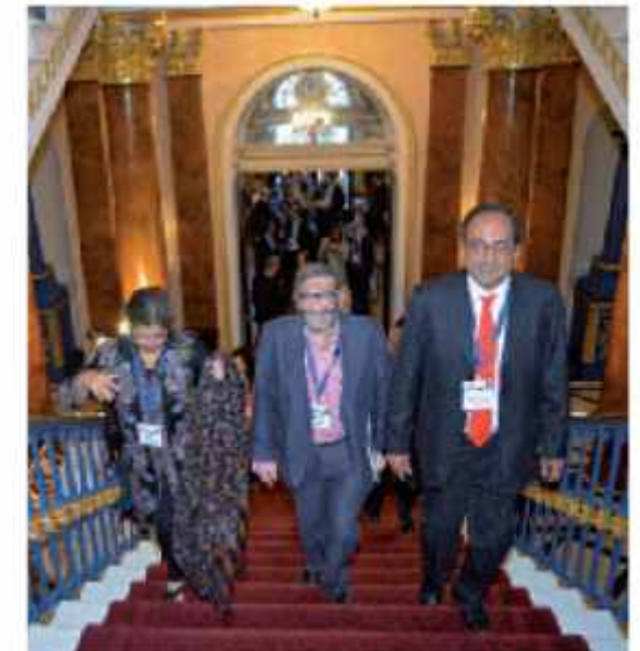
Participants arrive at the Liverpool Townhall for the closing plenary