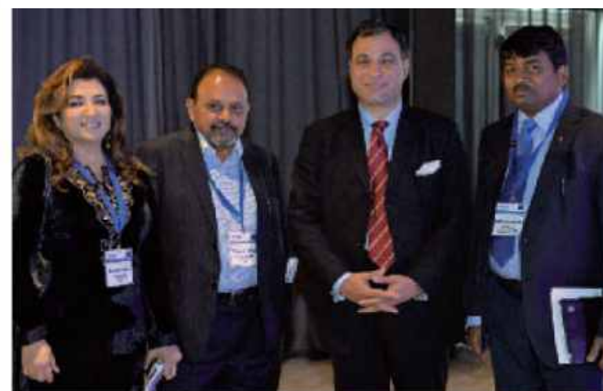
Participants gather prior to the opening plenary