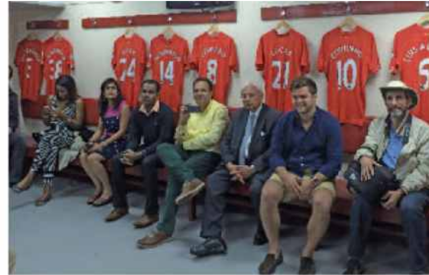
At the changing room of FC Liverpool