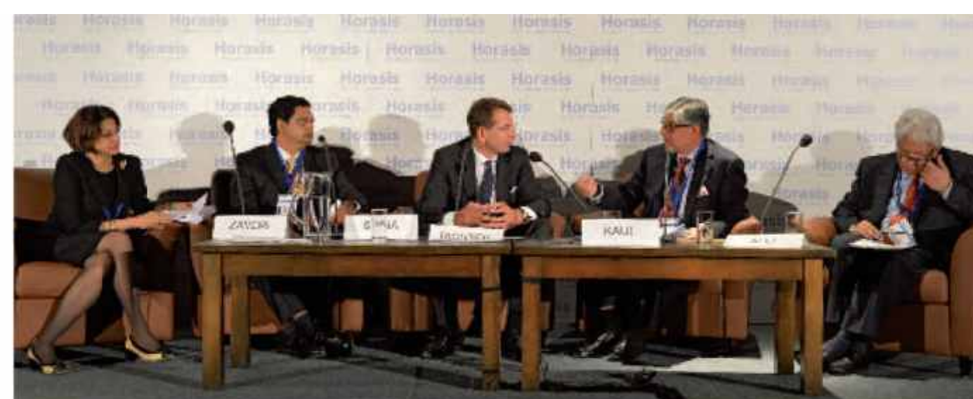
Closing plenary panel – Modelling Economic Growth