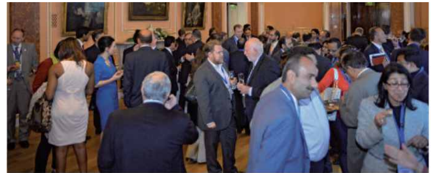
Reception at the Liverpool Townhall