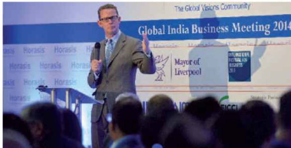
Gregory Barker, Minister of State for Energy and Climate Change, United Kingdom, keynoting the Global India Business Meeting

With this Global India Business Meeting, Horasis aimed to present an interdisciplinary and systemic view of the major economic, societal and technological drivers currently at work in India and the world. The location of the meeting rotates annually, and was held so far in Munich (2009), Madrid (2010), Naples (2011), Antwerp (2012) and Belfast (2013). The 2014 Global India Business Meeting was part of The UK's International Festival for Business, a series of global business events held in Liverpool to celebrate entrepreneurship and economic growth. The event was organised by Horasis in partnership with the Liverpool City Council.