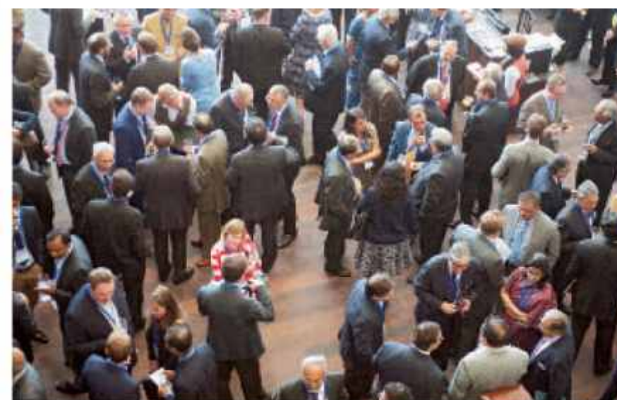
Gathering of minds