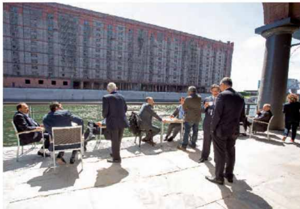
The meeting took place at Stanley Dock – a conservation area characterised by massive port-related structures