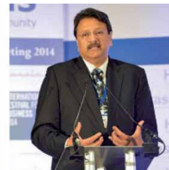
Ajay Piramal, Chairman, Piramal Group

growth. He recognized the importance of bureaucratic reform. 'Better governance is key,' he said. 'We need to curb corruption. And we have to increase the service level of the public administration,' he added. He concluded by stating that India is forging a strong skills base, which will not only meet the country's future needs but also help bridge the global skills in the future.