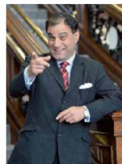
Lord Karan Bilimoria, Chairman, Cobra Beer Partnership, United Kingdom