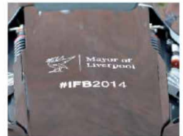
The 2014 Global India Business Meeting was part of International Festival for Business (IFB)