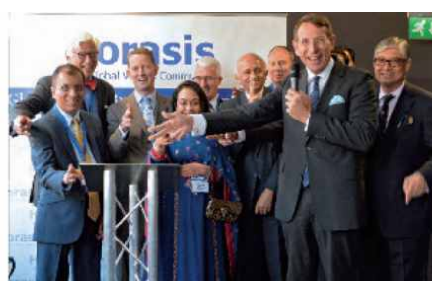
Virtual Ribbon Cutting Ceremony