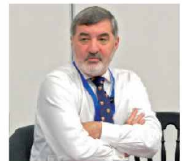
Lord Alderdice, Convenor of the Liberal Democrat Party, United Kingdom

Business School India Research Centre, India, the country needs more focused efforts to match the skills that are needed in fast evolving labour markets with the type of education on offer in India. ‘Many young people entering secondary education are unable to read, and sadly they pass through the system without gaining further abilities. Modern economies demands employees can read,’ said Lord Alderdice , Convenor of the Liberal Democrat Party, United Kingdom. Hari Krishna Maram , Founder and Chief Executive Officer, Imperial College, India, suggested that 15 percent of India’s national budget should be spent on education compared to the existing 10 percent.