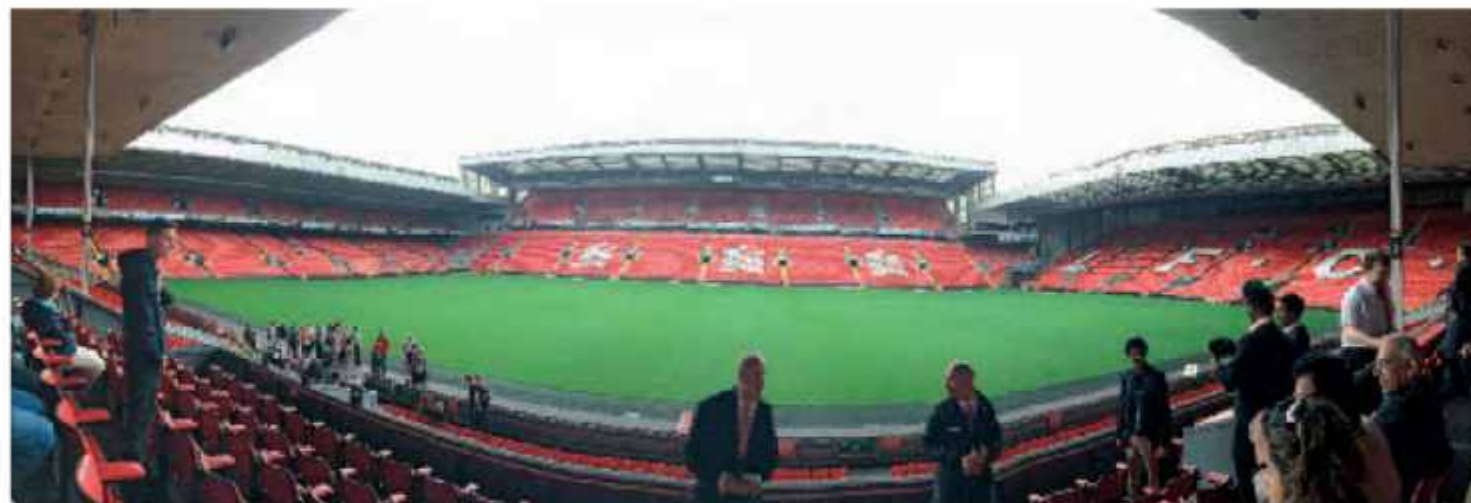
Participants visit Anfield, Liverpool FC's iconic football stadium

The next major opportunity for growth came from the Bangalore Mumbai Economic Corridor, on which a feasibility study is currently under way. 'It offers a real opportunity for India and the UK to build on its partnership and build a 21st century partnership,' he said.