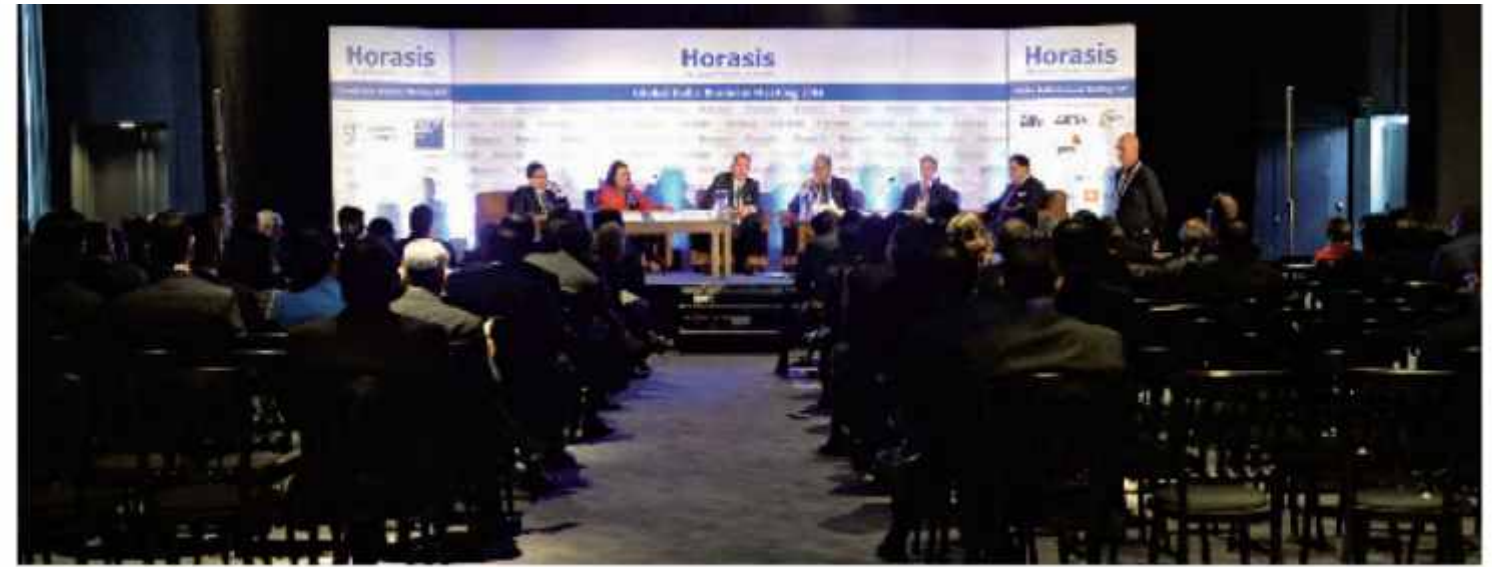
Opening Plenary – India and World Economic Outlook

This report – which builds on the outcome of the meeting – is an attempt to summarise the discussions which took place at the Global India Business Meeting. Also, it shall serve as a catalyst that stimulates further thinking on the issues and questions that were raised. Being a business-focused gathering, valuable opportunities for businesses were identified during the various panels as well as on the sidelines of the event.