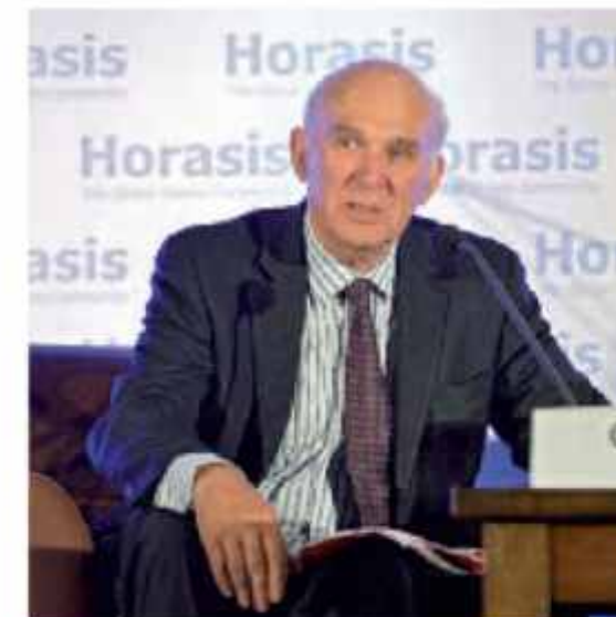
Vince Cable, Secretary of State for Business, Innovation and Skills, United Kingdom