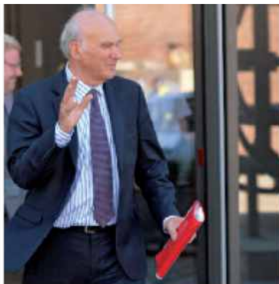
Arrival of Vince Cable, UK Secretary of State for Business, Innovation and Skills