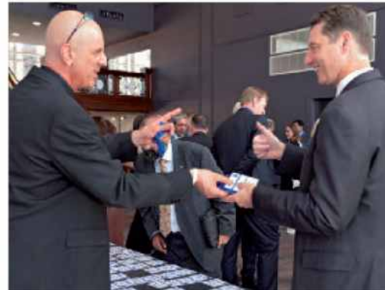
Participants registering for the Global India Business Meeting