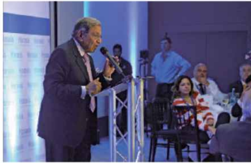
N.K. Singh, Former Secretary to the Prime Minister of India, speaking during the opening dinner

On 22-23 June 2014, the sixth Horasis Global India Business Meeting took place in Liverpool, United Kingdom. The event was the first international business meeting on India held after the 2014 elections. The meeting's leitmotif was to engage participants to provide a timely perspective on the future direction for India. The Global India Business Meeting gathered a collective audience of 250 Indian and global entrepreneurs, business leaders and government officials.