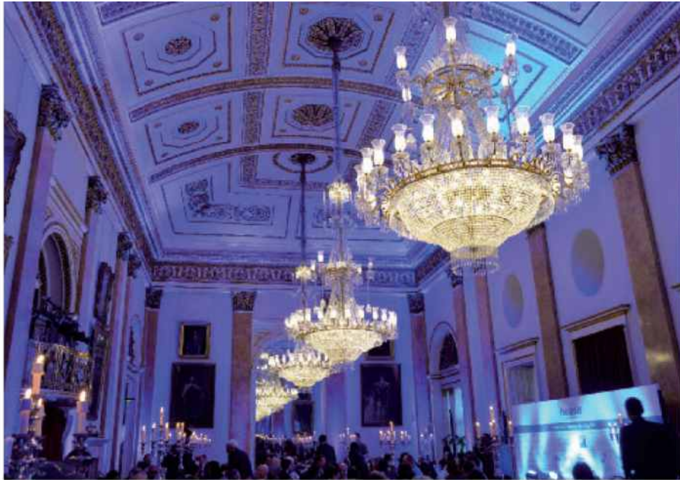
Liverpool City Hall – venue of the closing dinner