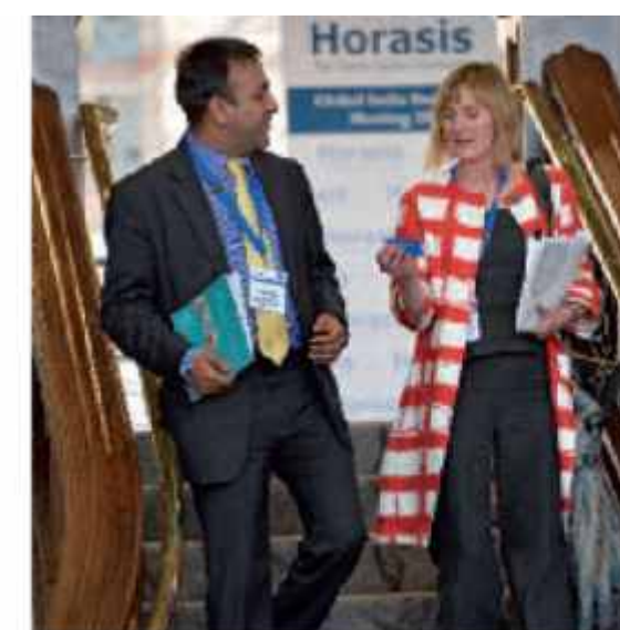
Networking during a break

Trade Agreement were launched in June 2007 but both the sides are still engaged in bridging the gaps on several issues. At stake is an agreement that would create one of the world's largest free-trade zones by population – covering 1.8 billion, or more than a quarter, of the world's people. Minister Cable told participants that the negotiations are progressing well. 'Still, a number of sticking points have yet to be overcome,' he said. Rahul Bajaj stressed the need for both sides to reach a deal, particularly given the current economic stress.