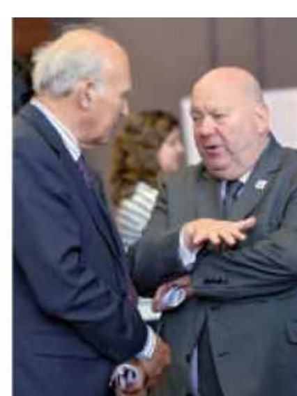
Joe Anderson, Mayor of Liverpool, in discussion with Minister Vince Cable