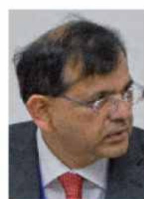
Rajindre Tewari, Chairman, Europe India Business Council, The Netherlands

'It is important to increasingly leverage global value chains'