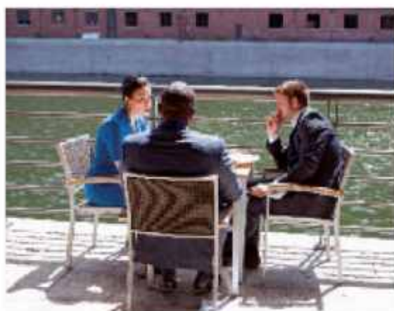
Meeting on the sidelines of the event

In his welcoming speech, N. K. Singh , Former Member of Parliament, Former Member of the Planning Commission, Former Secretary to the Prime Minister, India, said that the Indian government will push for more economic reforms in the months ahead, including the easing of limits on foreign direct investment in various sectors. 'We want to liberalize trade and engage with the United Kingdom and all other dynamic economies of the world,' the Minister said. Bullish about India's growth, N. K. Singh shared his estimation of double-digit GDP growth in the years to come. He announced that the Indian economy could be worth as much as USD 40 trillion by 2040. This would constitute 20 percent of the world economy, up from the current two percent. He pointed out that favourable demographics, technology, and an appreciating rupee were among the factors which favoured this economic