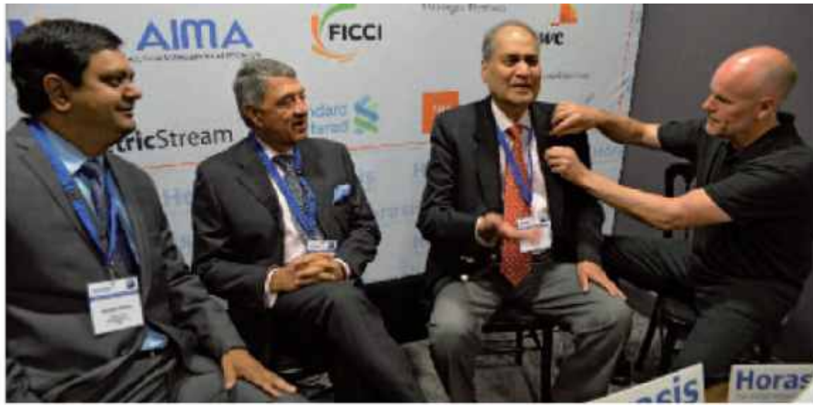
Many interviews were arranged on the sidelines of the event