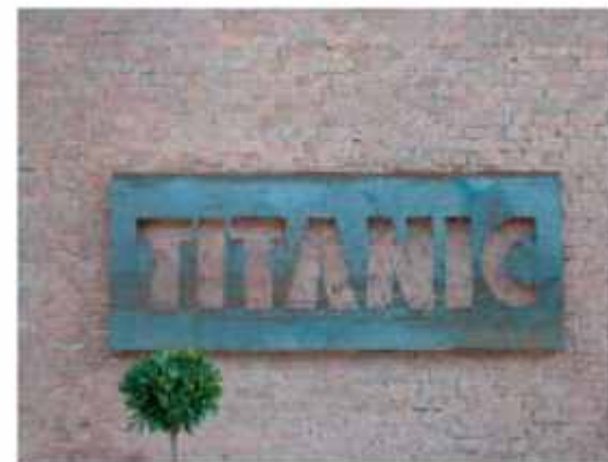
The Titanic Hotel – venue of the Global India Business Meeting