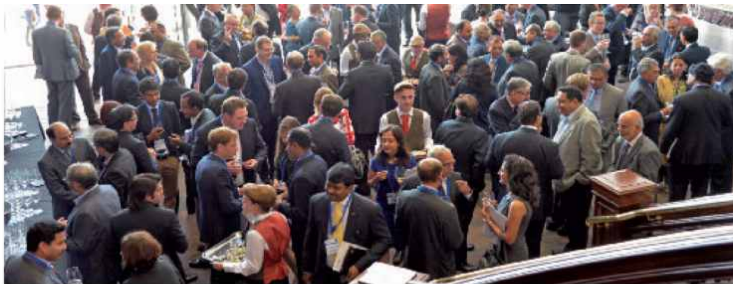
Participants gathering for the welcome reception

Addressing participants, Gregory Barker , Minister of State for Energy and Climate Change, United Kingdom, said that 'India holds great promise for economic engagement with the United Kingdom.' 'Both India and the United Kingdom being great economic partners that we will find the ways to further deepen and diversify our economic engagement,' he continued. In conclusion, the Minister expressed his confidence in the 'India Story' and shared his belief that Britain could be a springboard for Indian companies to reach out to Europe and the world. 'Our partnership with India will play an important role in our economic growth pattern,' he said. He was also optimistic about the EU India Free Trade Agreement, which he believed would be signed in the near future.